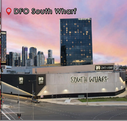
DFO South Wharf