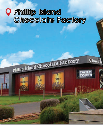
Phillip Island Chocolate Factory