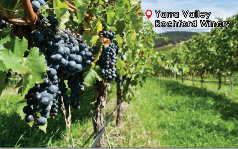
📍 Yarra Valley Rochford Winery