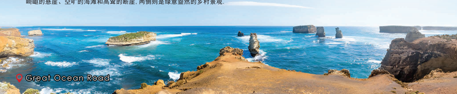
📍 Great Ocean Road