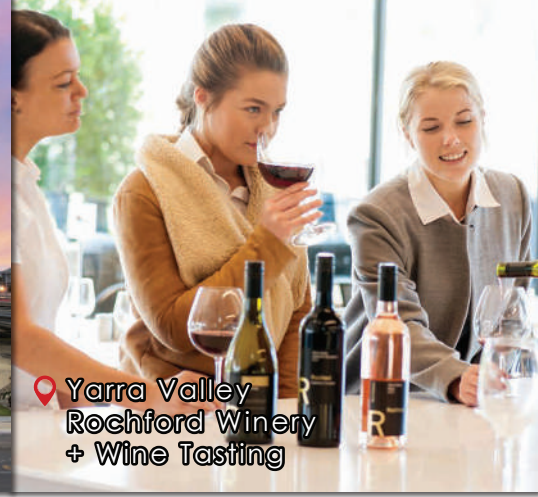
Yarra Valley Rochford Winery + Wine Tasting