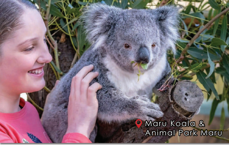
📍 Maru Koala & Animal Park Maru