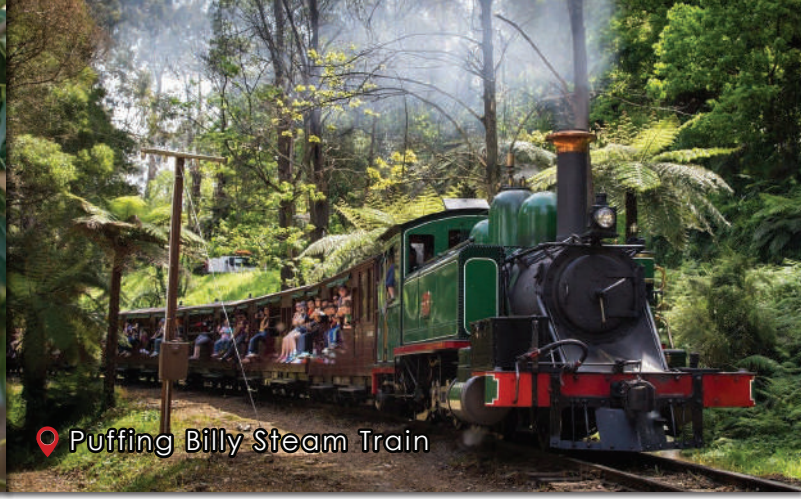
📍 Puffing Billy Steam Train