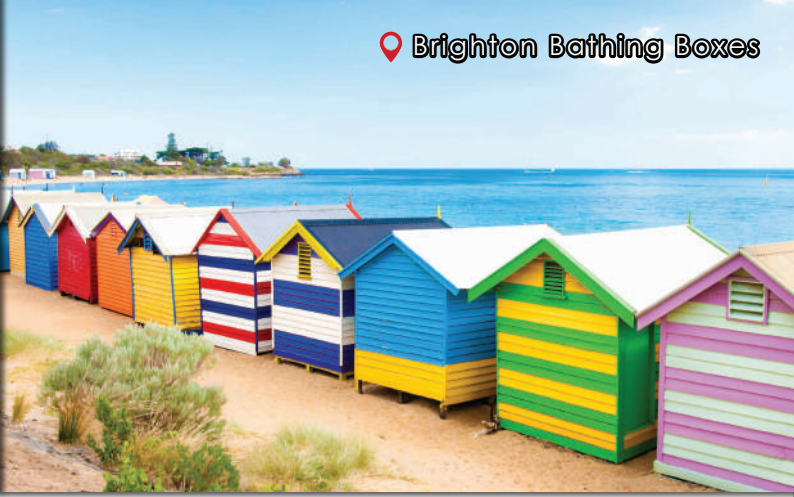
📍 Brighton Bathing Boxes