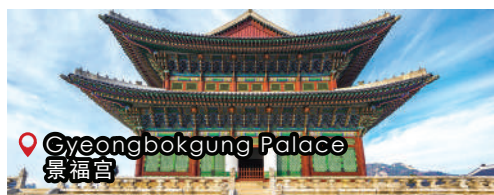
Gyeongbokgung Palace 景福宫