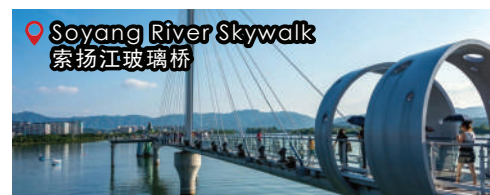
Soyang River Skywalk 索扬江玻璃桥

*以上行程&照片仅供参考，最后安排以当地旅社为准*以上酒店将以当地等级为准**The above itinerary is subject to change upon final discretion of local land operator*Above Hotel rate are based on Local Standard*images only for indicative.