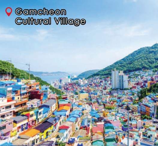
Gamcheon Cultural Village