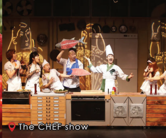
The CHEF show