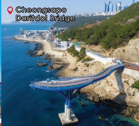
Cheongsapo Daritdol Bridge