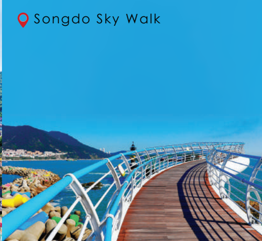
Songdo Sky Walk