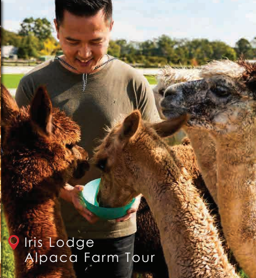
📍 Iris Lodge Alpaca Farm Tour