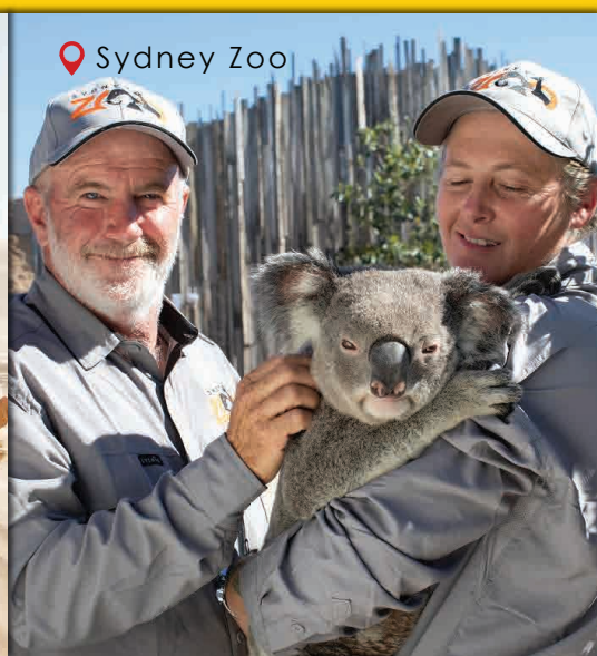
📍 Sydney Zoo