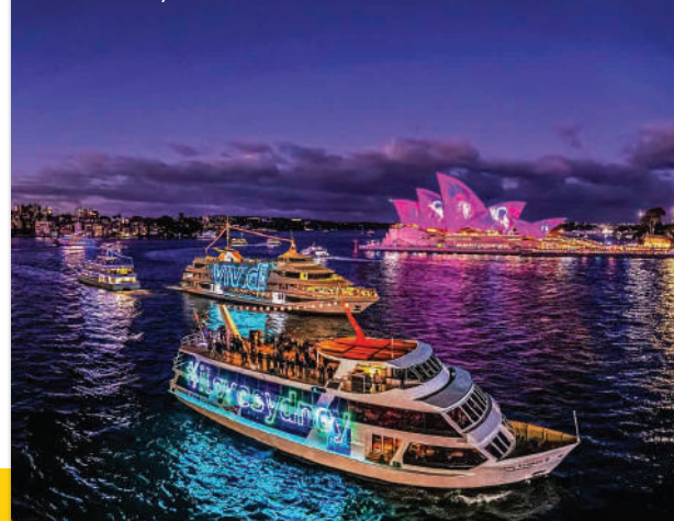
Captain Cook Vivid Early Dinner Cruise