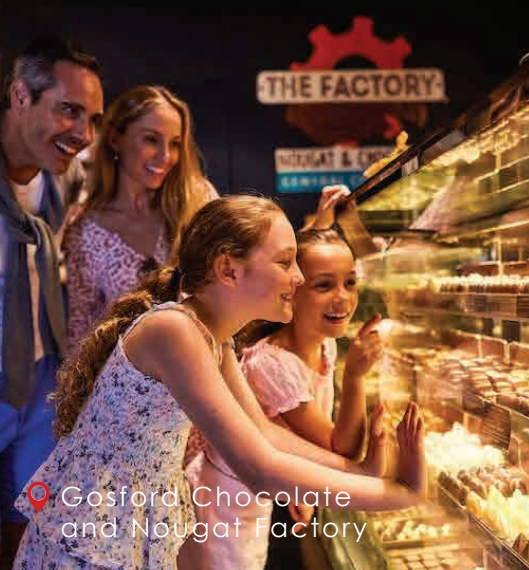
📍 Gosford Chocolate and Nougat Factory