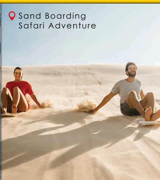
📍 Sand Boarding Safari Adventure