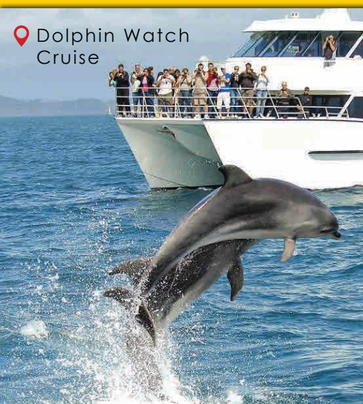
📍 Dolphin Watch Cruise