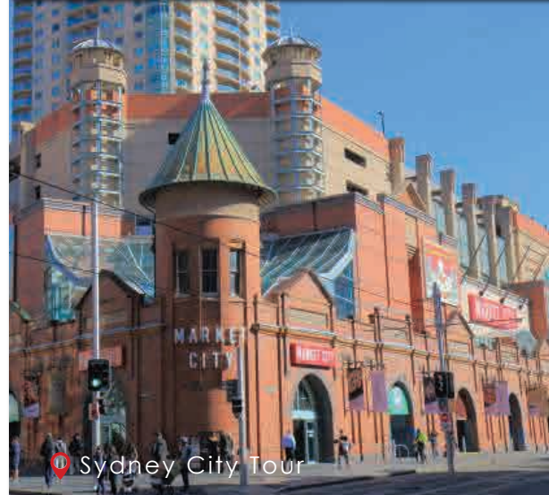
Sydney City Tour