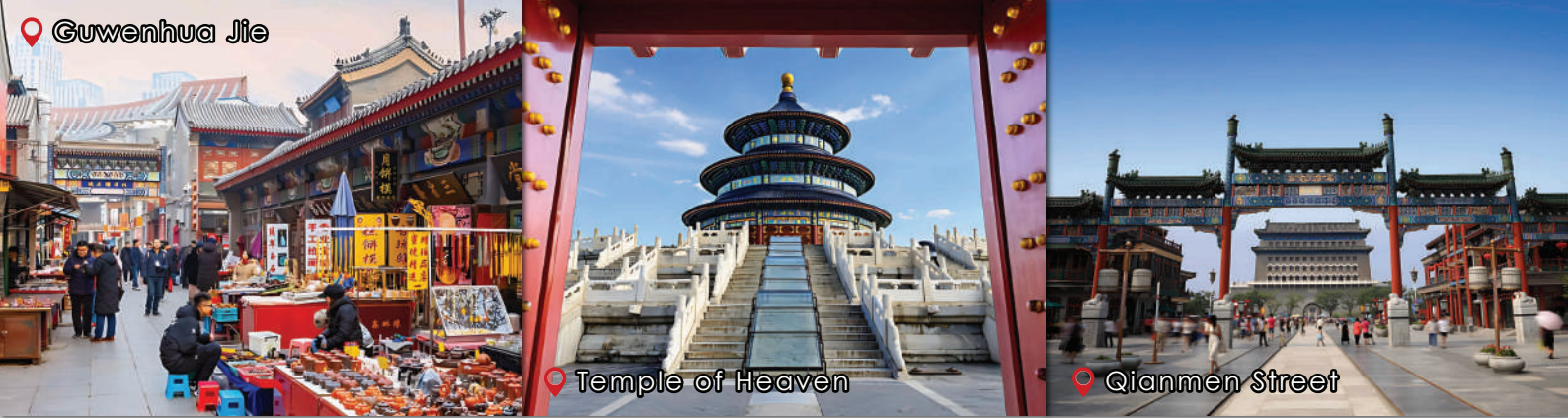
Temple of Heaven