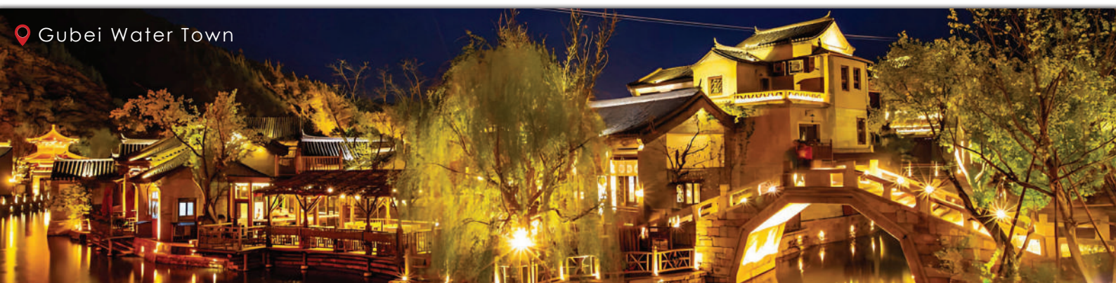
Gubei Water Town