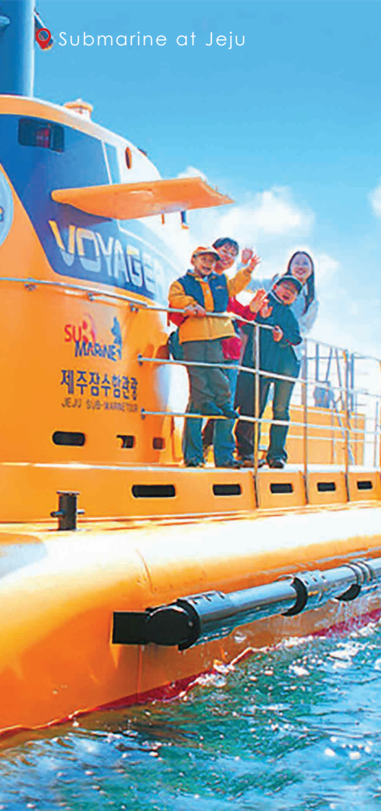
Submarine at Jeju