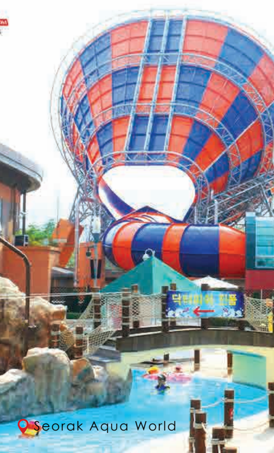
Seorak Aqua World

■ 神奇之路 ：一段长100米的斜坡道路，由于周围的丘陵和树木关系，因此在视觉上给人一种‘上坡’的感觉，其实只是一种错觉的现象。