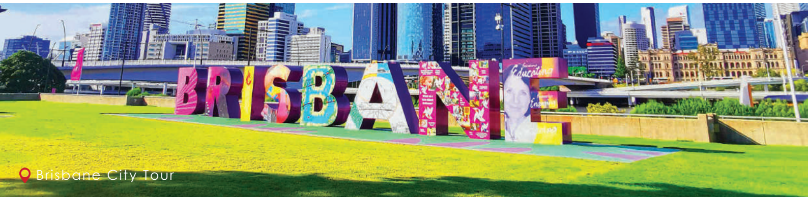
Brisbane City Tour