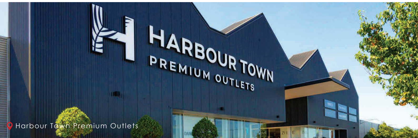
📍 Harbour Town Premium Outlets