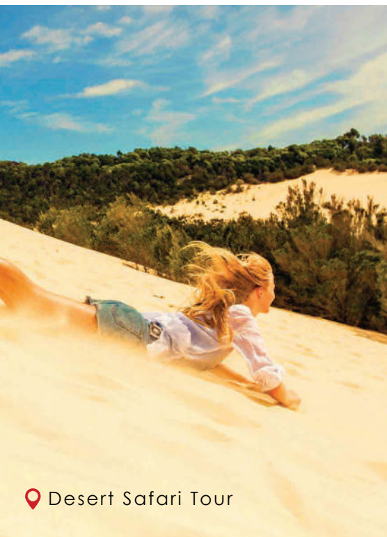
Desert Safari Tour