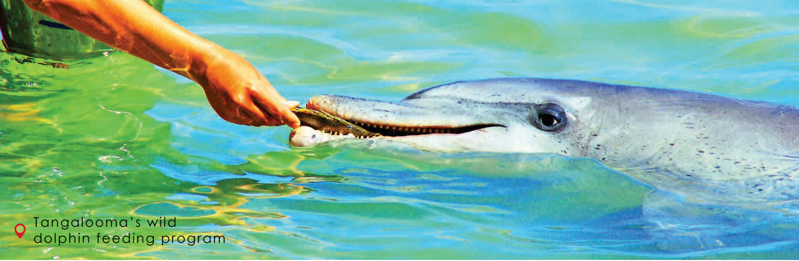
📍 Tangalooma's wild dolphin feeding program