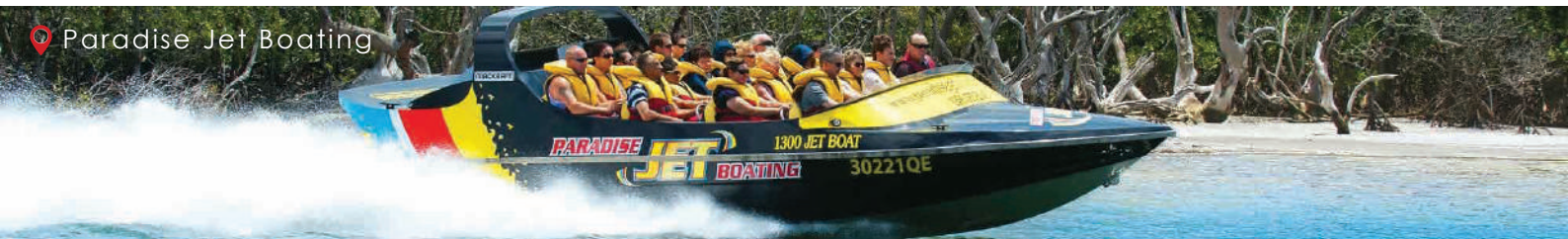
Paradise Jet Boating

DEPARTURE DATE & FLIGHT DETAILS 出发日期 & 航班详情